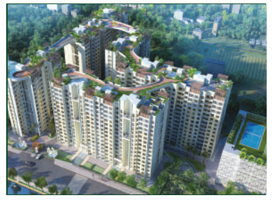
SUDURO A RIVA SIDDHA PROJECT

siddhasuburbia.com HIRA/P/SOU/2018/000119 hira.wb.gov.in