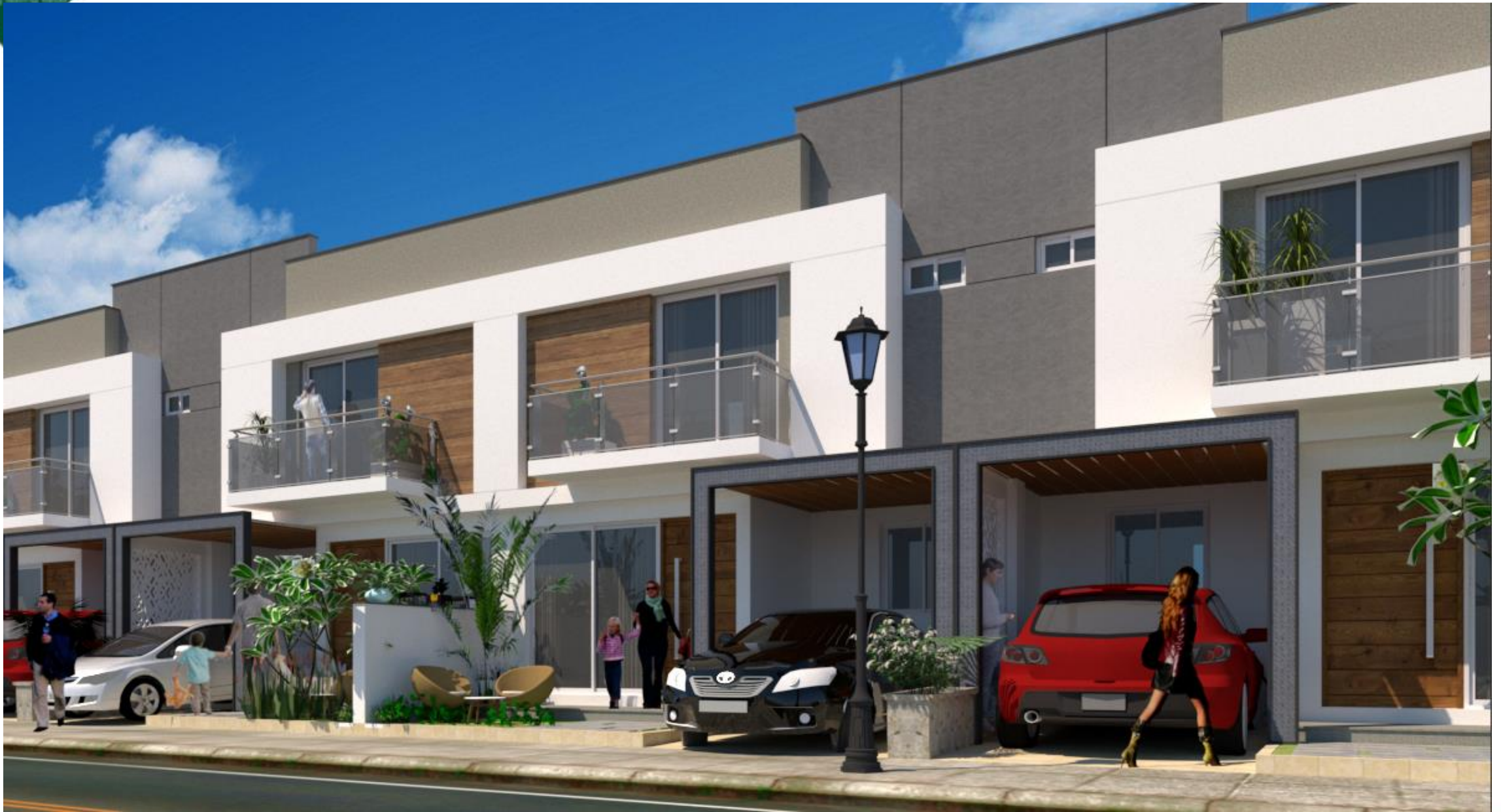
VIEW- 2 (With Glass Railing)