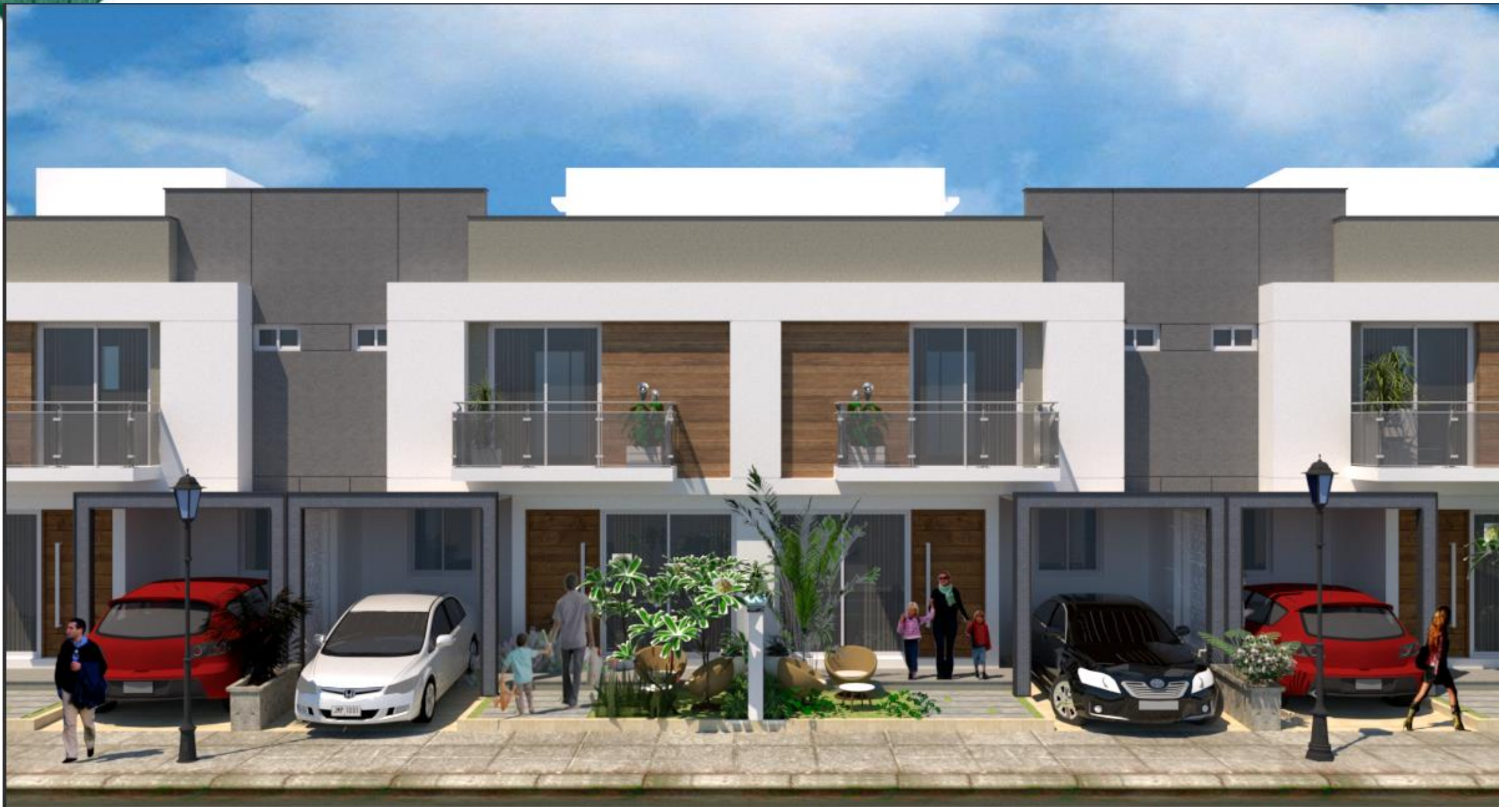
VIEW-1 (With Glass Railing)